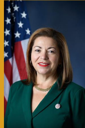
Linda Sanchez U.S. Congress