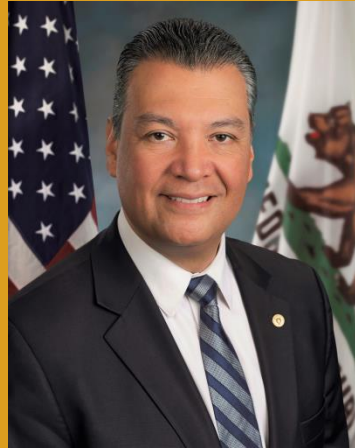
Alex Padilla U.S. Senate