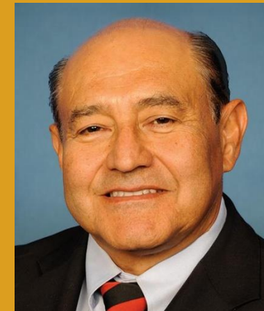
Lou Correa U.S. Congress