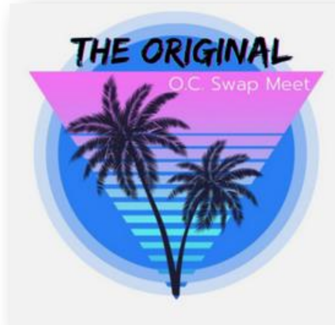
Small Business Saturday