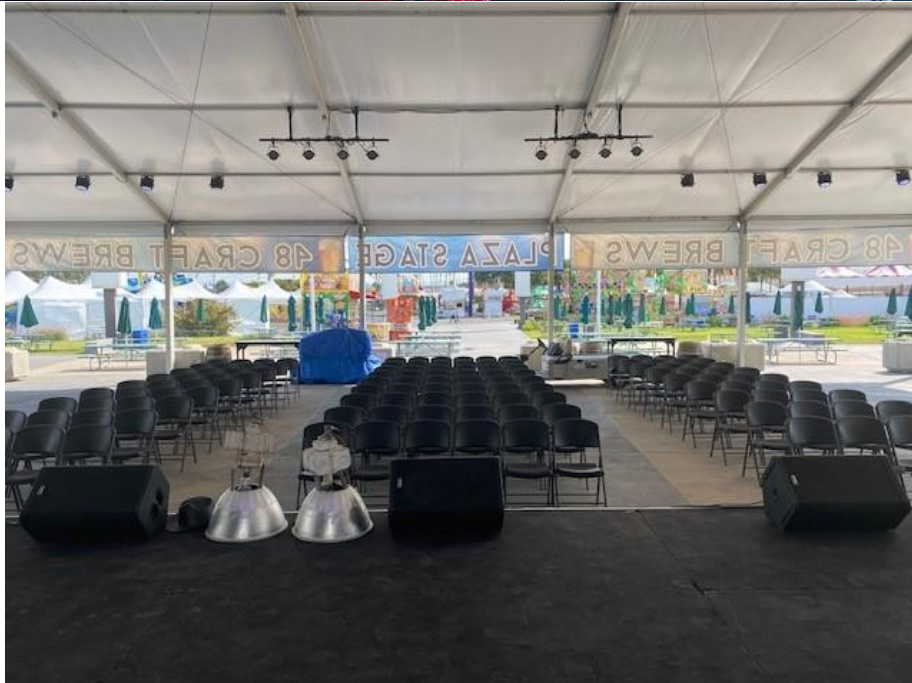
View from Plaza Stage